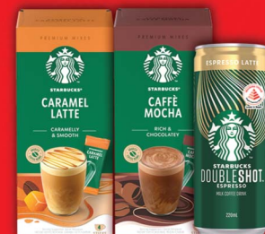
STARBUCKS® Premium Mixes / Doubleshot™ & Frappuccino® (assorted)