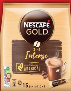
NESCAFÉ® GOLD 3in1 Original/ Intense 20 sticks/15 sticks (assorted)