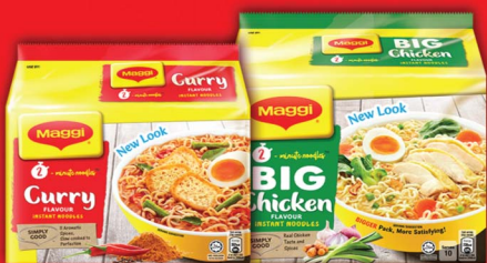
MAGGI® 2-Min/ BIG Noodles (assorted)