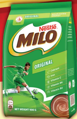
MILO® Original 900g/18 sachets Also in Sachets!