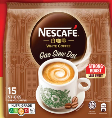
NESCAFÉ® White Coffee Gao Siew Dai 15 sticks