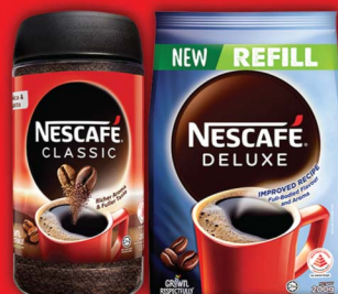
NESCAFÉ® Classic/ Deluxe 200g