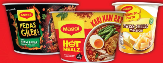
MAGGI® Instant Bowls/ Cups (assorted)