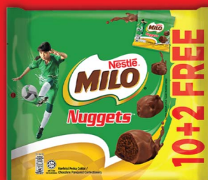
MILO® Nuggets Party Pack 12 packs x15g