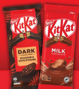
KIT KAT® Block Chocolates Dark/ Milk (assorted)