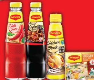
MAGGI® Red Sauces/ Oyster/ Concentrated Chicken/ Stock Cubes (assorted)