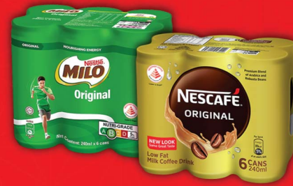
MILO® Can/ NESCAFÉ® Can 6x240ml (assorted)