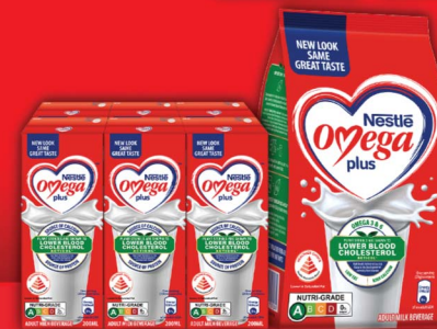
OMEGA PLUS® ActiCol (all pack sizes)

While stocks last! Terms apply. Products may vary from store to store.