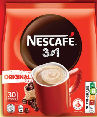
NESCAFÉ® 3in1 Original 30 sticks