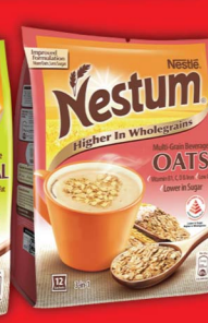
NESTUM® 3-in-1 Cereal Milk Drink (assorted)