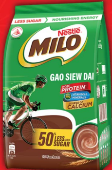
MILO® Gao Siew Dai 13 sachets