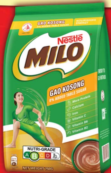
MILO® Gao Kosong 750g/15 sachets Also in Sachets!