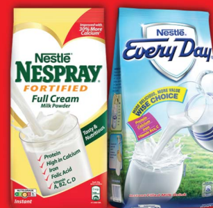
NESPRAY® Full Cream/ EVERYDAY® Milk Powder (all pack sizes)