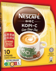
NESCAFÉ® White Coffee/ Singapore Kopi 15 sticks/10 sticks (assorted)