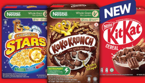
NESTLÉ® Wholegrain Breakfast Cereals (all brands and pack sizes)