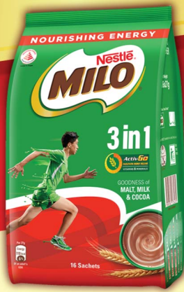
MILO® 3in1 16 sachets