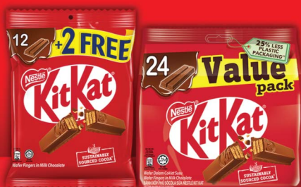
KIT KAT® 2-Finger Sharebag 14 bars/24 bars