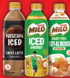
NESCAFÉ® Iced MILO® Iced Energy / Dairy Free Soy & Almond 500ml