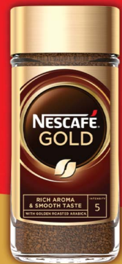
NESCAFÉ® Gold 200g