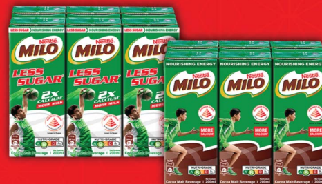
MILO® Original/ Less Sugar Packet 6x200ml